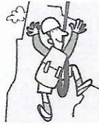
climb a mountain