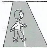
cross the road